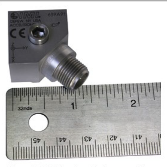
Figure 3: PCB Piezotronics has recently released Model 639A91, an ICP® triaxial accelerometer with a footprint less than 1" square and 13kHz frequency response on all three axes.

• Robust Housing: In the world of industrial accelerometers, the robustness of the sensor's housing is not determined by one single factor. It is determined by the housing material, the level of sealedness that the housing provides and the electrical isolation of the housing. Most industrial accelerometer housing are 304 or 316 stainless steel and hermetically sealed in order to withstand chemical exposure and wide operating temperature ranges. A case-isolated housing allows an accelerometer to be mounted on equipment with poor electrical grounding without running the risk of signal contamination. The isolation is typically achieved with the use of a Faraday cage, a continuous enclosure around the sensor's electronics to repel noise.